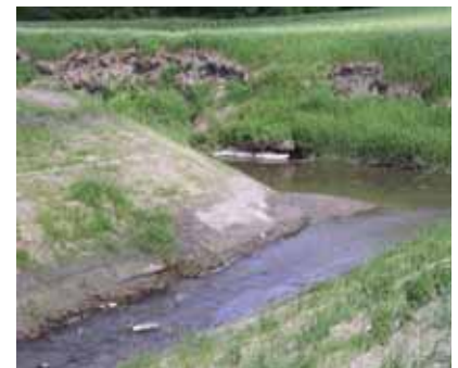
Stabilization of Co. Ditch 11