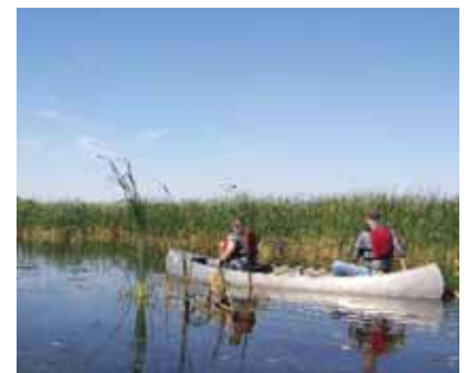
Canoers enjoy improved water clarity of Pickerel Lake