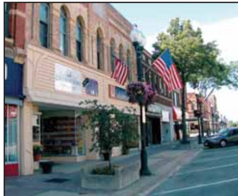
Downtown Albert Lea

Work continues at the Albert Lea Airport with the taxiway being paved this summer. Two new clarifiers will be installed at the Waste Water Treatment Plant.