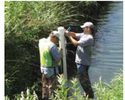
SRRWD staff collecting water quality data