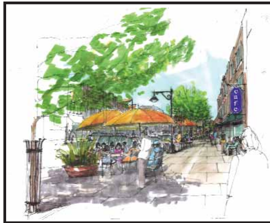
Architect's rendering of proposed downtown

Requests for proposals were sent out at the end of November for an Engineering firm to work on the final engineering for the project. A firm will be hired in January.